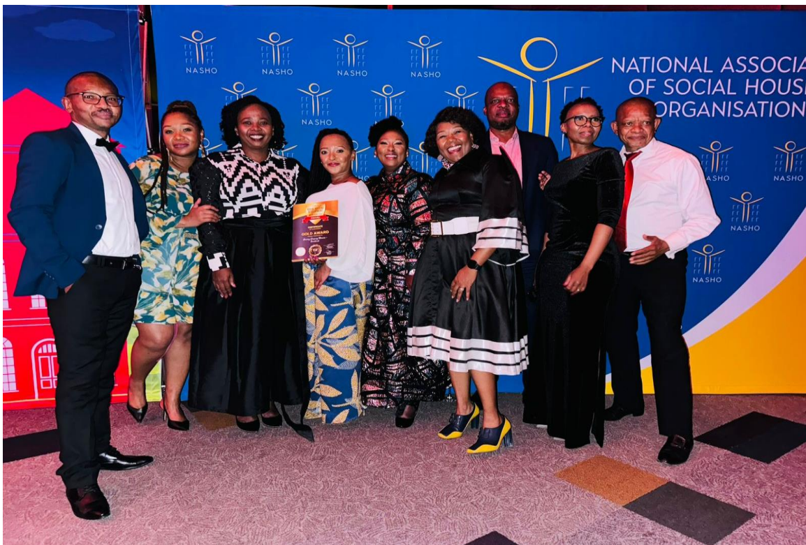
Pic: HCT Board Members, EXCO, and MANCO at the RESIDE Awards ceremony in Sandton - Johannesburg.