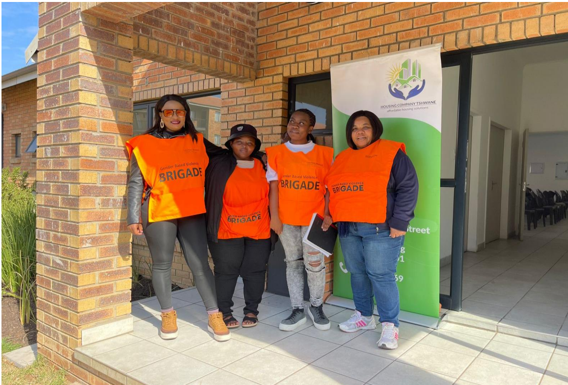
Pic: Gauteng Provincial Government Community Safety wardens.

HCT CEO cuts the ribbon in Atteridgeville 02